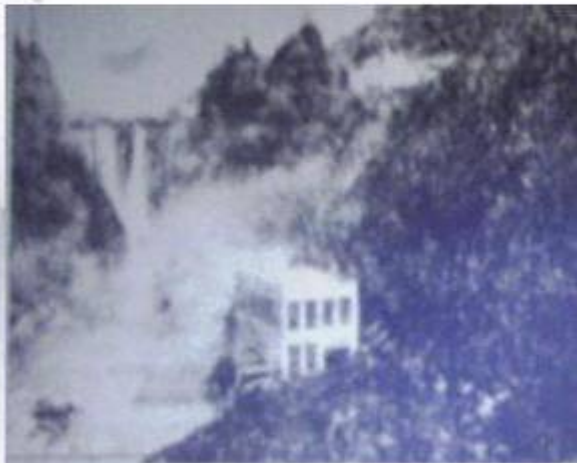
3. WALL SHOWS FURTHER FLOODS FIVE H.W.