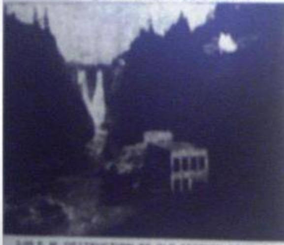
4. 2:05 P. M. DESTRUCTION OF OLD SECTION COMPLETE