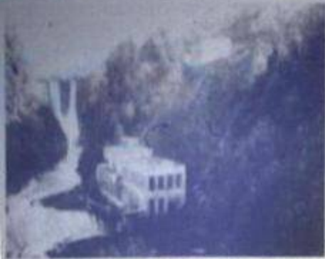
1. FLOOD COLLAPSED BY 11 A.M.