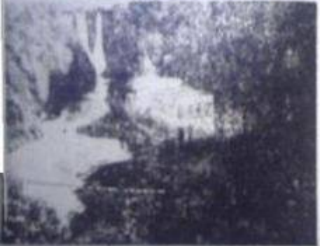
2. PRESSURE INCREASES—WALLS CRUMBLING